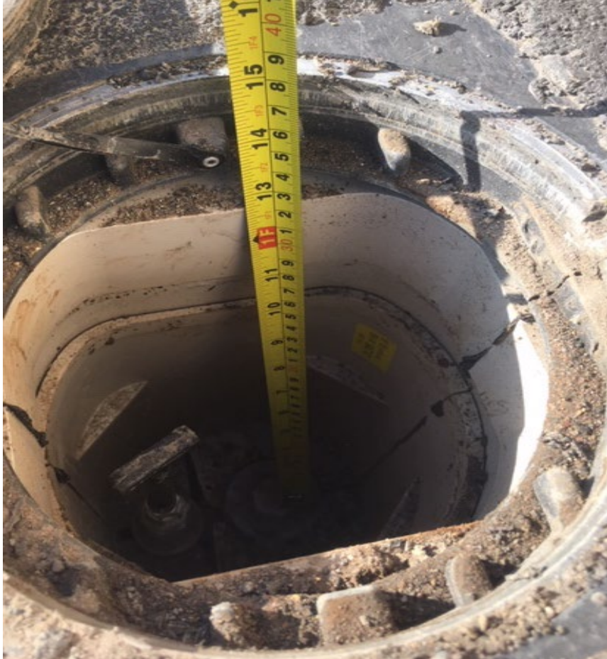
Non compliant boundary box