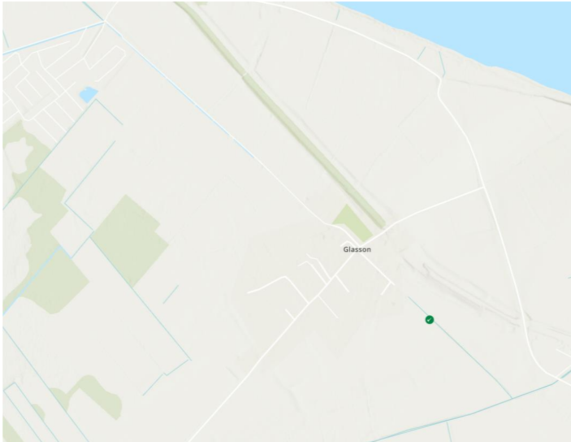
Figure 2: United Utilities – Better Rivers – Storm Overflow Map (November 2024) . The green dot marks Glasson Pumping Station Storm Overflow.

Glasson is a village in Cumbria, 8 miles Northwest of Carlisle and inland of the Solway coast at the mouth of the River Eden near Drumburgh. It sits North of the Drumburgh Moss Nature Reserve and East of the Glasson Moss Nature Reserve. Other surrounding land is mostly flat agricultural land.