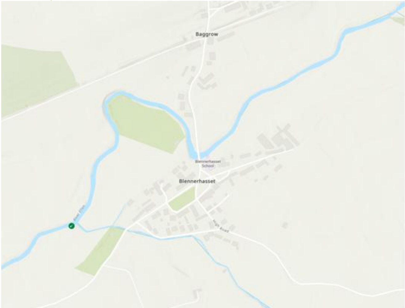
Figure 2: United Utilities – Better Rivers – Storm Overflow Map (October 2024). The green dot marks the Blennerhasset Pumping Station Storm Overflow.

The village of Blennerhasset lies on the River Ellen. It sits at the edge of the Lake District National Park, about ten miles inland. The area is predominantly rural, featuring agricultural and scenic land.