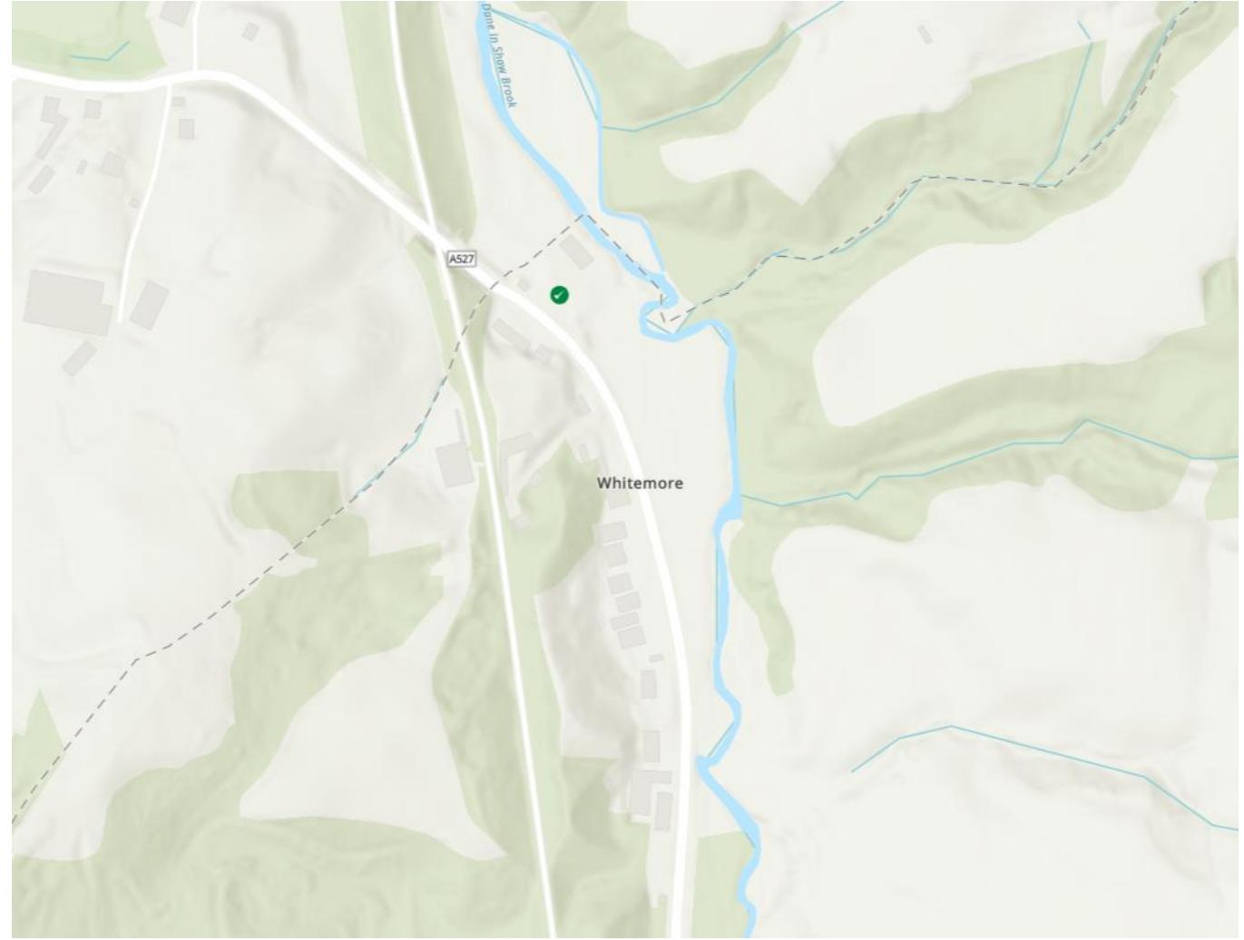
Figure 2: <u>United Utilities – Better Rivers – Storm Overflow Map</u> (November 2024). The green dot marks the Whitemore Pumping Station Storm Overflow.

Whitemore, Cheshire sits south of Congleton and north of Biddulph. It features a small area of housing and is bordered to the right by Biddulph Brook, a tributary of the River Dane.